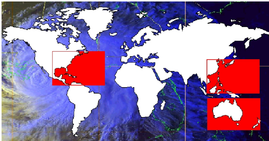
The three tropical cyclone basins under research by the TSR Tropical Storm Risk team.